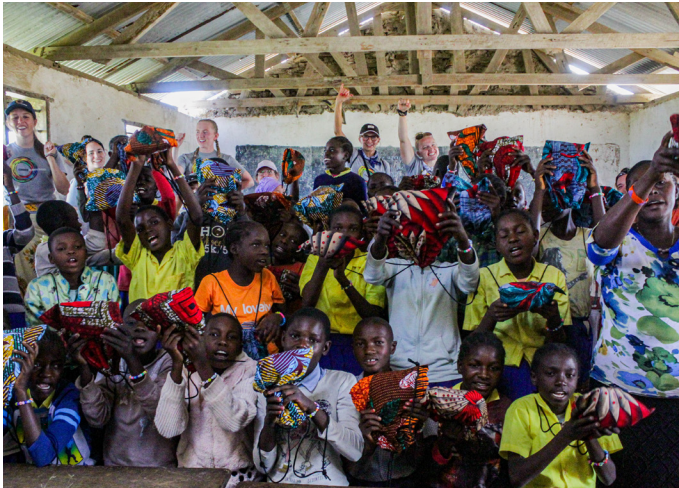
Students with their Days for Girls kits