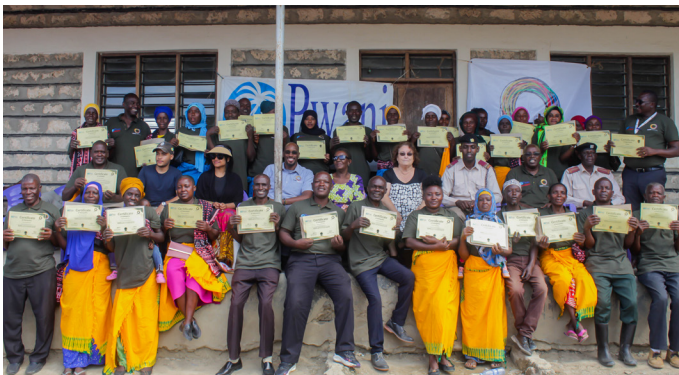
Muungano Farmers and guests of honor during a group photo session