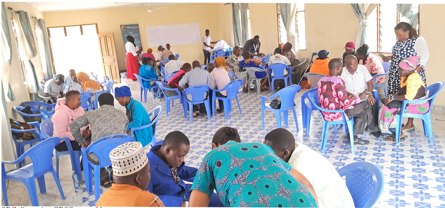
SDC discussing CBOs area of focus

CHOICE Kenya conducted a one day workshop with fourteen Community Based Organizations (CBOs) at Samburu Social Hall, Kwale County on 15th August, 2023. The aim of the workshop was to map key development stakeholders in the respective CBOs catchment areas and deliberate on their priority development focus areas. Further, during the workshop the CBOs discussed strategies for mobilizing local community resources, undertaking meaningful development projects, and how to ensure their projects have the desired impact. Each CBO was tasked with the responsibility to go and consult their members and community and draft an action plan that should guide them as they work in their communities.