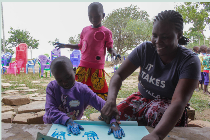
Making of learning Aid materials