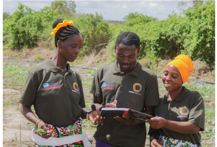
Baraka farmers discussing lessons learnt during their session