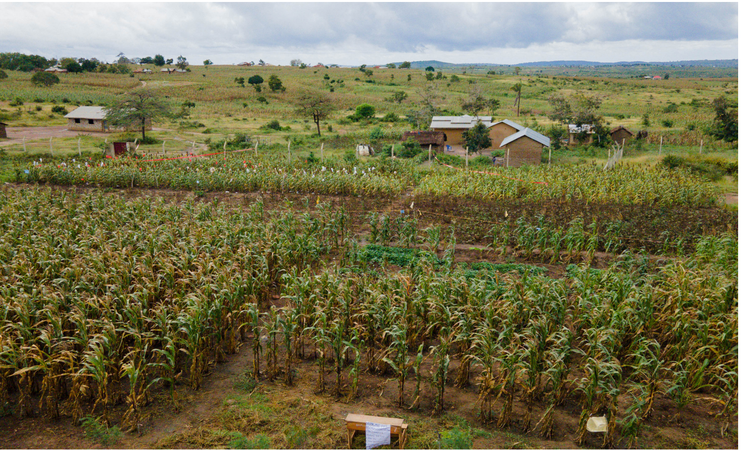
Muongano FFS demonstration farm