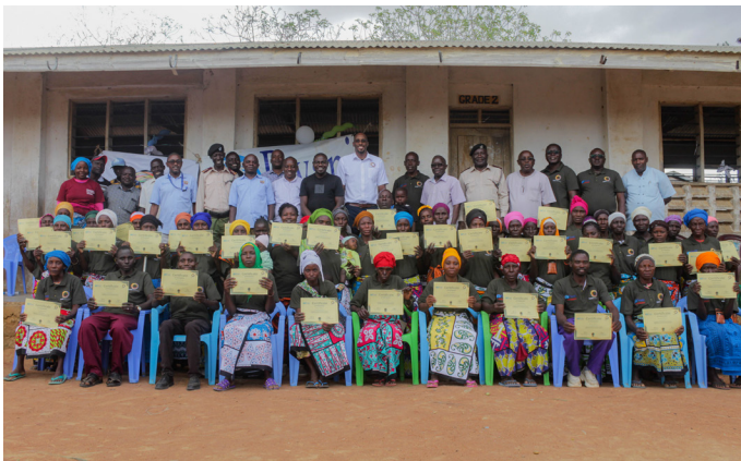
Silaloni Farmers and guests of honor during a group photo session