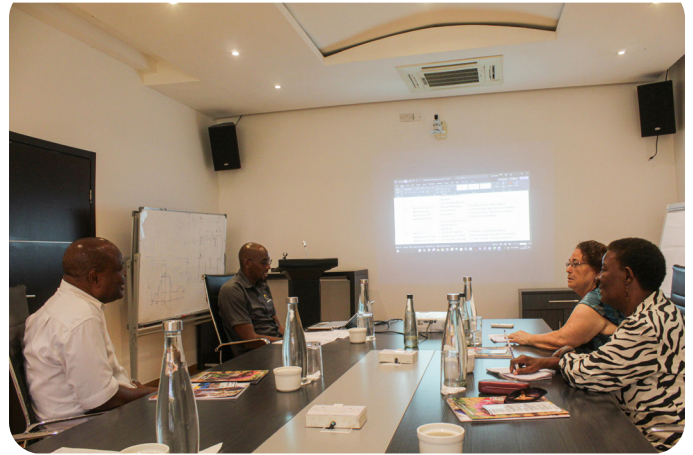
CHOICE Kenya during a board meeting on August 25th, 2023, Bahari Beach Hotel