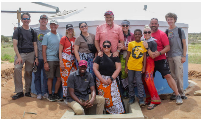
Expeditioners visiting Kanjaocha's project