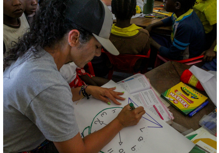
Making of early childhood learning aids