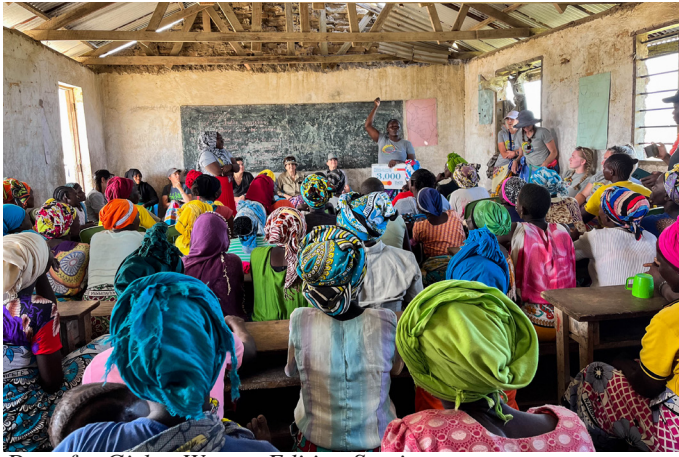
Days for Girls - Women Edition Session