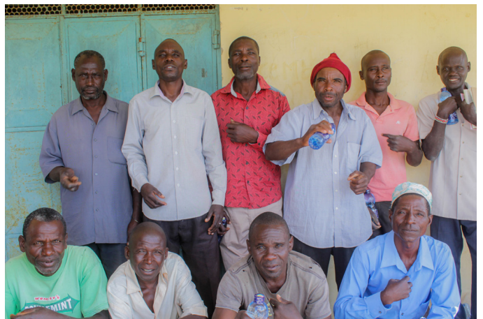
Maji ya Chumvi quarry