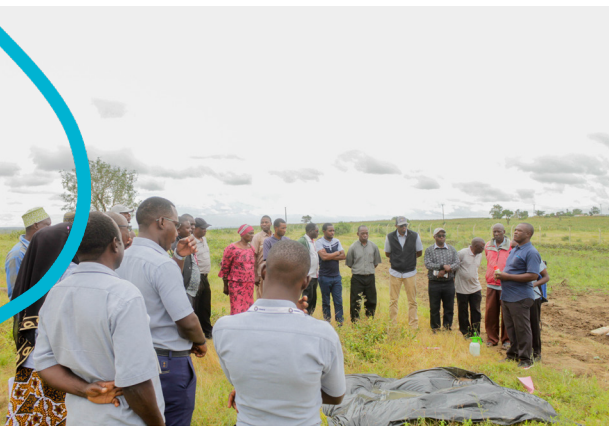
Guests taken through the Muungano FFS project