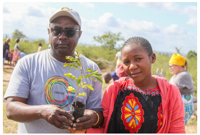
Tree planting session at Kanyumbuni Primary School