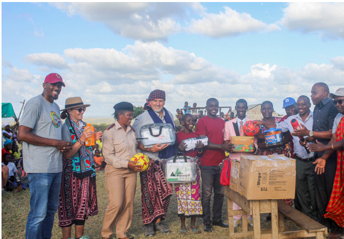
Expeditioners giving donations to Kanyumbuni school