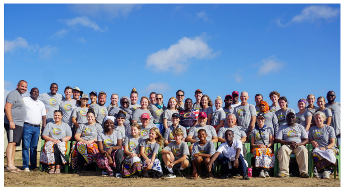
Kanyumbuni 2023 expeditioners