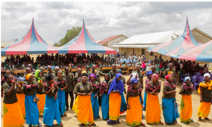
Muungano farmers celebrating their graduation day